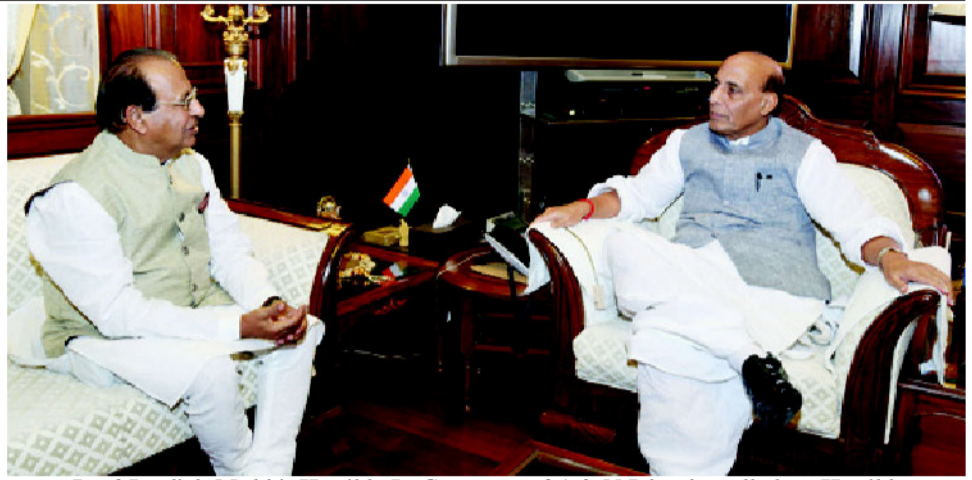
Prof Jagdish Mukhi, Hon'ble Lt Governor of A & N Islands, called on Hon'ble Home Minister, Shri Rajnath Singh at New Delhi on 22nd September 2016. Various issues pertaining to the Islands were discussed during the meeting.