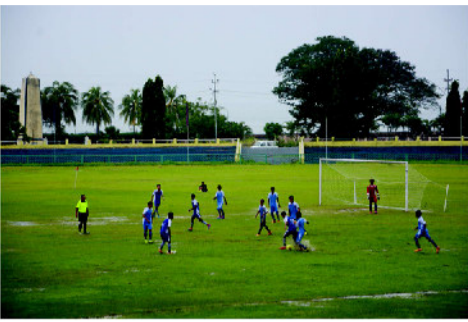
Staff Reporter Port Blair, Sept 22