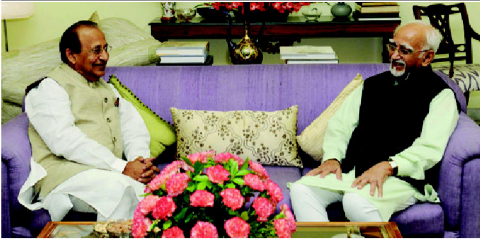
Prof Jagdish Mukhi, Hon'ble Lt Governor of A & N Islands, called on Hon'ble Vice-President of India, Shri M Hamid Ansari at New Delhi on 22nd September 2016.

Regn. No. 34190/75 No. 254 Port Blair, Friday, September 23, 2016 Web: dt.andaman.gov.in Rs. 3.00 4 Pages