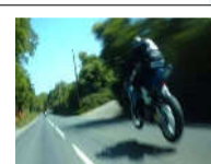
तेज गति से वाहन न चलायें ❌