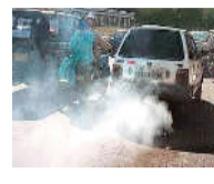
वाहन प्रदूषण ❌