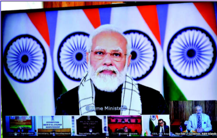
Admiral D K Joshi, PVSM, AVSM, YSM, NM, VSM (Retd.), Hon'ble Lt Governor, A&N Islands and Vice-Chairman, Islands Development Agency participated in the Video Conference chaired by Shri Narendra Modi, Hon'ble Prime Minister of India for interaction with different Aspirational Districts of States/ UTs to review implementation of various Schemes/Programmes of Government of India with the support of NITI Aayog.

The Prime Minister, Shri Narendra Modi interacted with DMs of various districts on the implementation of key Government schemes via video conference. The DMs shared their experience which has led to improvement of performance of their districts on a host of indicators. The Prime Minister sought direct feedback from them about the key steps taken by them which has resulted in success in the districts, and about the challenges faced by them in this endeavour. He also asked them about how they kept people working in their team motivated on a daily basis, and made efforts to develop the feeling that they were not doing a job but were performing a service.