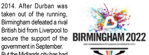
2014. After Durban was taken out of the running, Birmingham defeated a rival British bid from Liverpool to secure the support of the government in September. But the Midlands city has had to wait almost three months to have its victory confirmed. The CGF extended the deadline for bids until the end of November, saying Birmingham's candidacy was "not fully compliant", and then announced a further delay as it sought guarantees from the city and government. The CGF is believed to have encouraged rival bids from Canada and Malaysia, both of which failed to materialize.