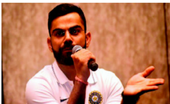
calculation of the figure and the subsequent rankings is based on estimates of entertainment-related earnings of celebrities. In order to ascertain the figures, Forbes took independent estimates from industry insiders, talent management agencies, film and TV production companies, publishers, music industry professionals, sports consultants, advertising and media agencies, brand marketers, celebrity managers and other relevant experts. Sachin Tendulkar is second in the sports list (Rs 82.50 crore), former India captain MS Dhoni is third (Rs 63.77 crore) and R Ashwin (Rs 34.67 crore) rounds off the top five cricketers in the list. Other non-cricketers in the list are: Saina Nehwal (Rs 31 crore), golfer Anirban Lahiri (Rs 12.44 crore), Kidambi Srikanth (Rs 6.13 crore), Sania Mirza (Rs 2.80 crore) and Sunil Chhetri, at 100th, on Rs 2.30 crore. In total, 21 sports personalities make the top-100.

New Delhi, Dec 22 Virat Kohli continues to remain head and shoulders above other sports personalities in the latest Forbes list where they name the highest earners. India skipper's tally reads Rs 100.72 crore, putting him in third place in the 100 celebrities list, behind Bollywood actors Salman Khan (Rs 232.83 crore) and Shah Rukh Khan (Rs 170.5 crore). They had finished top three in 2016 also but their cumulative earnings have dropped by almost 20 per cent. PV Sindhu, fourth in sports personalities list and 13th overall, is the highest money gainer (in percentage terms) with her brand rising after the 2016 Olympic silver medal. It has impacted her earnings which have increased nearly 17 times. The methodology for