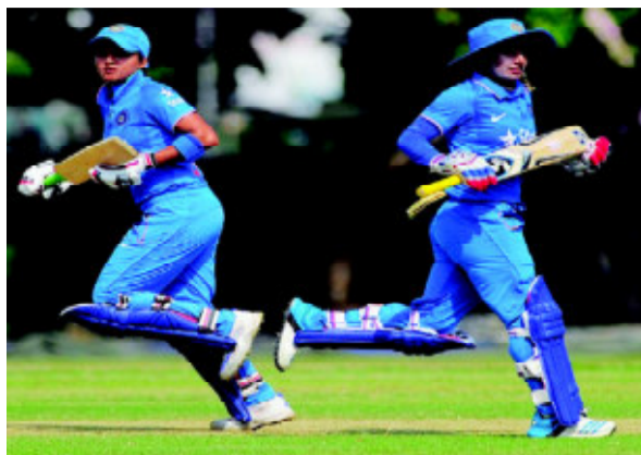
Stafanie Taylor of the West Indies appointed skipper of the 20-over side. The teams were selected taking into consideration player

Dubai, Dec 22 India captain Mithali Raj was today named in the ICC Women's ODI Cricket Team of the Year while left-arm spinner Ekta Bisht was the lone cricketer to find a place in the both the ODI and T20 Teams of the year announced by the world body. Besides the duo, Harmanpreet Kaur has found out a place in the ICC Women's T20I Team of the Year. The ICC today announced the women's ODI and T20I teams of the year with England's Heather Knight named as captain of the 50-over side and