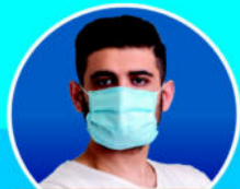
Wear your mask properly