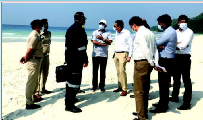
Administration inspected the visited Swaraj preparatory ensuing VVIP visit to A&N Islands. The Dweep today and arrangements being made in view of the