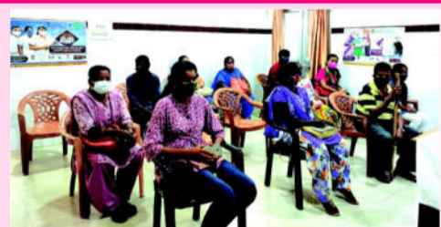
Beneficiaries waiting to get vaccinated at Dr. R.P. Hospital, Mayabunder

The vaccination drive is continuing smoothly in A&N Islands and as per data provided by Directorate of Health Services, a total of 2,68,200 beneficiaries have been vaccinated so far in A&N Islands, out of the target beneficiaries of 2,81,603 (approx.). A total of 5513 people were vaccinated today in A&N Islands. Today, 2476 beneficiaries were vaccinated in South Andaman District, out of which, 926 were in the age group of 18-44 years. Similarly, 1901 beneficiaries were vaccinated in North & Middle Andaman District out of which, 1329 were in the age group of 18-44 years. In Nicobar District, 1136