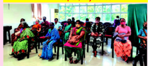
Post vaccination waiting hall

beneficiaries were vaccinated out of which, 770 were in the age group of 18-44 years. A total of 73,954 eligible people in the age group of 18 to 44 years have been vaccinated till date. Interacting with the DT Reporter, the beneficiaries who were waiting to be vaccinated at Dr. R.P Hospital this morning, expressed their happiness for the