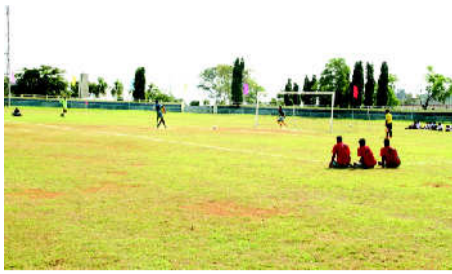
match to be played at Netaji Stadium at 1 pm on Nov. 24 while Manipur meet Kerala in the second semi final to be played at 3 pm tomorrow at the same venue.

In the semi final, Haryana will lock horns with Delhi in a