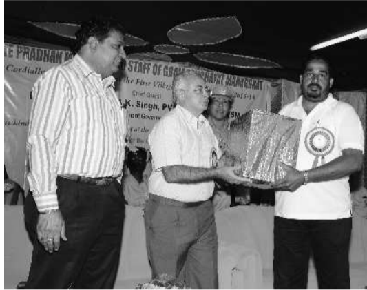
Staff Reporter, Port Blair, Jan 24