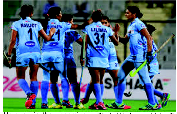
Uruguay in the upcoming will be held in June and July with tournament. The Hockey Women's World League Semifinal to be the two venues.

New Delhi, Mar 24 The Indian women's hockey team led by striker Rani to take part in the World League Round 2 starting on 1st April in West Vancouver. The Indian eves are going into the tournament as the top ranked side. High on confidence after scripting a 5-0 series whitewash over Belarus earlier this month, the eves will vie for top honours when they clash with teams like Belarus, Canada, Mexico, Trinidad and Tobago, Chile and