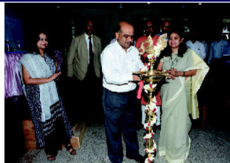
Administrative institutions need to come out and do something innovative and inculcate in them the spirit of enterprises, which according to her is the sole source of livelihood. She appealed to the participants to take maximum benefit of the workshop and acquaint themselves of the innovative technology being imparted in the workshop.

(Contd. from page 1) The Islands have accumulated knowledge for traditional medication, which could be harnessed for the benefits of all, he said. Stressing the need for finding innovative solution for water conservation, health and sanitation, which are the serious concern of the whole country, the Chief Secretary said that such innovative solutions are required in these sectors as most part of the country experiences water crisis, sanitation and health problems. There is need to find way how to meet these challenges by adopting innovative technology. People have the equal role in this regard and should also themselves find solution for these problems with the support of the Government, he said.