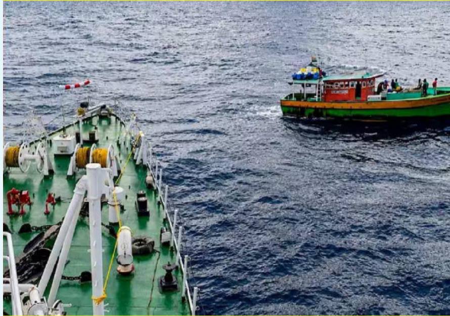
The Great Nicobar Project could redefine India's maritime power, economic ambitions, and geopolitical future

China recognised this transformation earlier than