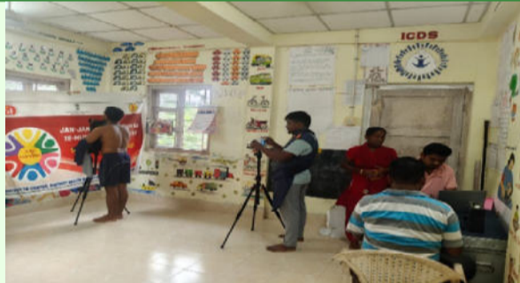
Ayushman Arogya Shivir conducted at AWC Nayagarh under PHC Baratang