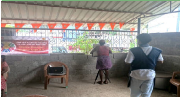
Ayushman Arogya Shivir conducted at, Shiv Temple, Doodhline -1, under HWC Shadipur