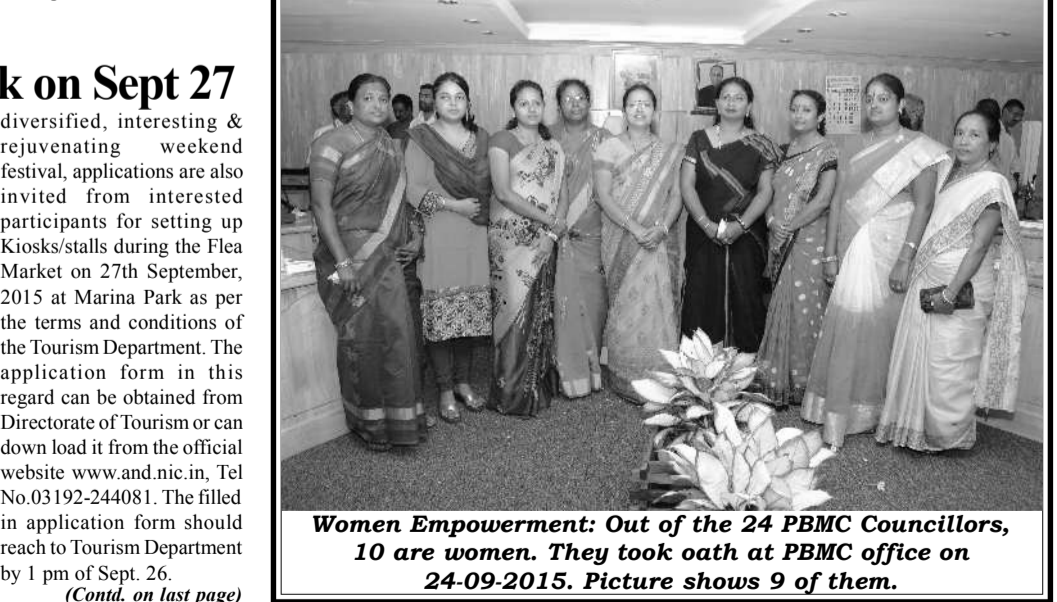
Women Empowerment: Out of the 24 PBMC Councillors, 10 are women. They took oath at PBMC office on 24-09-2015. Picture shows 9 of them.