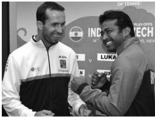
play-offs from October 30 to November 1. Next year's World Group final will be held from November 25 to 27 to 29.

(Contd. from page 1) MEA spokesperson Shri Vikas Swarup has tweeted that Indian Mission in Jeddah is continuously monitoring situation in Mecca following the tragic stampede. The Saudi civil defence authority said that the rescue operations were underway and two teams of medical screening have been set up at the site of the incident. Earlier on 11th September, a crane collapse incident at Mina near Mecca claimed over 100 lives, including that of 4 Indians.