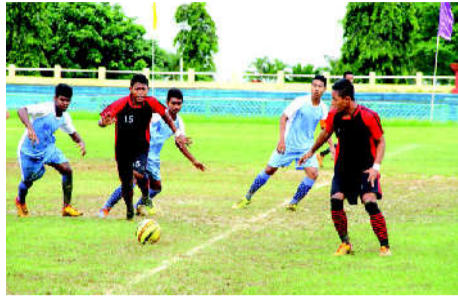
Nancowrie zone scored 1 goal.