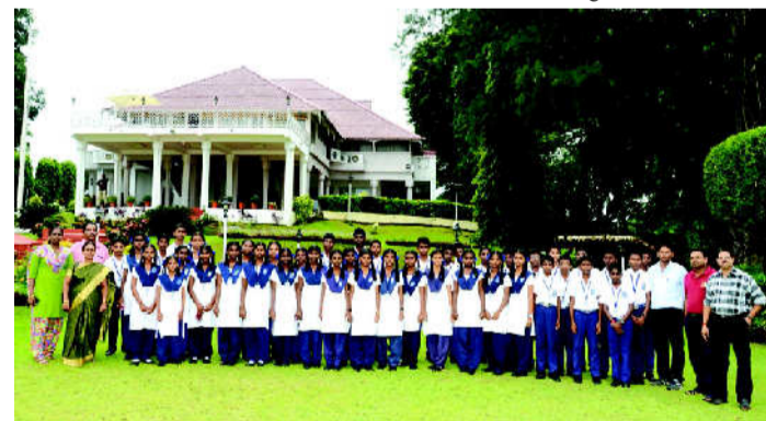
Students from Govt Senior Secondary School, Bhatubasti accompanied by their teachers visited Raj Niwas on 24th September 2016 to see the gardens and other attractions.

All the branches including ration shops of the Consumer Cooperative Stores Ltd. shall remain closed on Sept. 29 & 30, 2016 for half yearly physical stock verification, a communication from the Secretary, CCS Ltd. said.