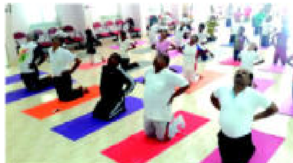
Yoga Day celebration by Education Department at Govt. Model Sr. Sec. School.