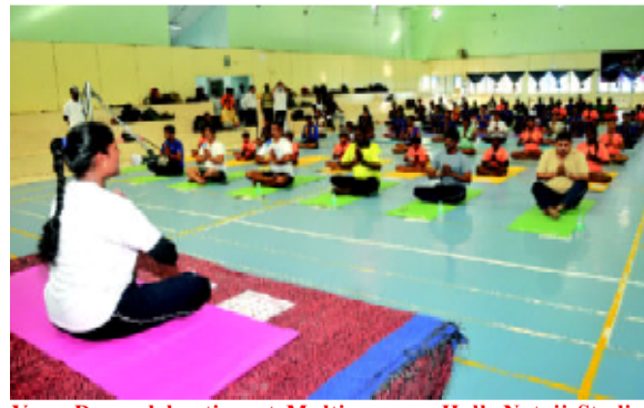
Yoga Day celebration at Multipurpose Hall, Netaji Stadium