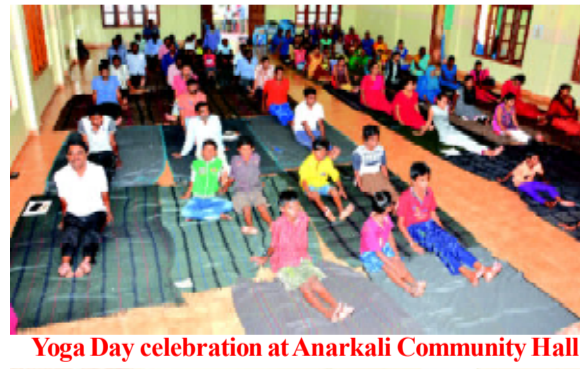
Yoga Day celebration at Anarkali Community Hall