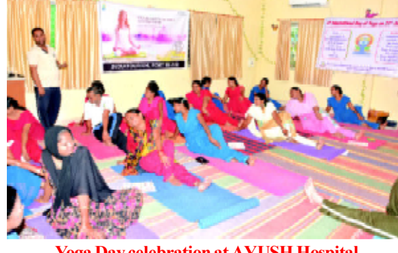
Yoga Day celebration at AYUSH Hospital

New CSC at Rangat Port Blair, June 21 The general public of Rangat have been informed that the CSC allotted for Rangat at M/s Roy Enterprises, Opp. State Bank of India, Rangat has been withdrawn. A new CSC at Rangat has been allotted at Room no-05, Panchayat Building, Rangat. The general public of Rangat can avail the services from the new CSC allotted at Rangat, a communication said