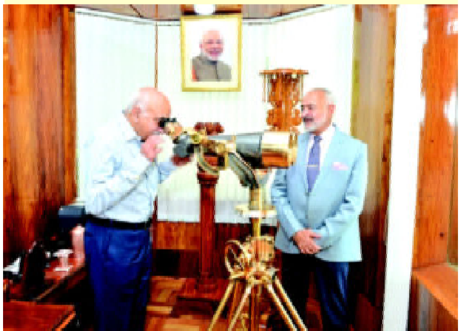
Shri M.J. Akbar, the Minister of State for External Affairs being shown the pre-world war - II era Japanese Binocular Telescope at Raj Niwas, by Admiral D K Joshi, PVSM, AVSM, YSM, NM, VSM (Retd.), Lt. Governor, A&N Islands.

This telescope is installed inside the office of the Lt. Governor and oversees the Ross Island and the entrance to Port Blair Harbour.