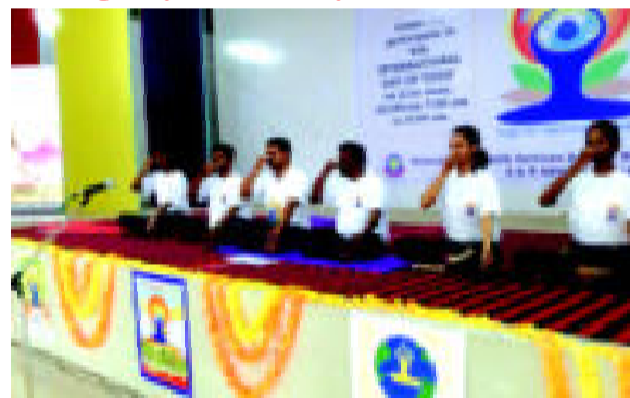
Yoga Day celebration by Indiatourism.