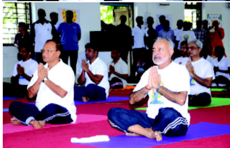
Port Blair, June 21

Along with the rest of the world and country; the 4th International Day of Yoga was celebrated in these Islands too today. The A&N Administration had set up as many as 43 centers in South Andaman, North & Middle and Nicobar Districts where hundreds of yoga enthusiasts from all corners of the Islands participated in this year's yoga demonstration this morning.