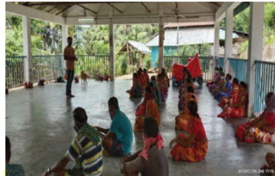
Training to SHG ladies & MGNREGA beneficiaries of GP Shibpur of Diglipur Block of N&M Andaman District

The training to the CRPs was given in two modes. One, directly to the CRPs through meetings and secondly, through teleconferencing / over telephone to the CRPs living in other far-off Islands or in the restricted areas. The CRPs were provided with the training materials given by the NMMU. All the training materials were provided through emails or through whatsapp. All the informative material i.e. picture messages, video messages, posters, presentation, etc where shared with the CRPs, Community Cadets, SHG leaders & members, MGNREGA- Gram Rozgar Sewaks, villagers of different Gram Panchayats through social media - whatsapp for further sharing with the rural people and to help them to take all