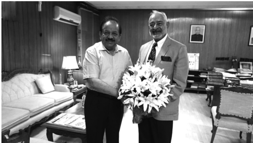
The Lt. Governor, A&N Islands, Admiral DK Joshi, PVSM, AVSM, YSM, NM, VSM (Retd.), called on the Minister of Environment, Forest & Climate Change, Dr. Harsh Vardhan at New Delhi on 25th April, 2018. The A&N Administration has taken up the issue of de-listing of Crocodiles from Schedule - I and requested for the early approval of the proposal.

better communication services, Information Technology based and other Micro, Small and Medium Enterprises (MSME) would be promoted in the Islands. Further, after carrying out systematic study, 18 Projects, both in Andaman & Nicobar and Lakshadweep, have been identified for implementation, out of which 7 Projects are ready for launch through PPP. 3 such projects in Andaman & Nicobar (one each in Long, Smith and Avis Island) and 3 in Lakshadweep (one each in Suheli, Minicoy and