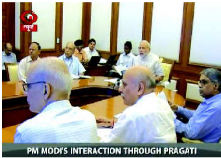
PM MODI'S INTERACTION THROUGH PRAGATI

New Delhi, Aug 25 Prime Minister, Shri Narendra Modi, on Wednesday chaired his fourteenth interaction through PRAGATI. The Prime Minister reviewed the progress towards handling and resolution of grievances related to school education and literacy. During an appraisal of the progress of Aadhar enrollment, it was noted that overall enrollment is now close to 105 crore, and special attention is being given to