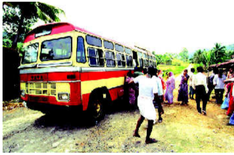
9531905403. Transport Department will be displaying charts showing the Do's & Don'ts for the crews in the bus. First Aid boxes and complaint boxes will also be provided in the buses. Transport Department also has plans

Port Blair, Aug 25 As a measure towards improving the service delivery to the commuters travelling in public transport buses operated by STS and to improve the grievance redressal system, the Transport Department has launched a new system by the name of "Aapki Suvidha Aapki Nazar" (ASAN). In this system, commuters can post their grievances as well as praiseworthy activities in the bus supported with photographs or/ and video clippings to a designated Whatsappapp having telephone number