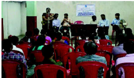
Port Blair, Sept. 25

The State Bank of India organised 'town hall meeting for farmers and rural customers' on Sept. 22 at various blocks of South Andaman, North & Middle