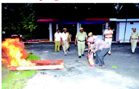
Port Blair, Sept. 25

The 4th batch of a 5 days training programme on 'first aid fire fighting & disaster preparedness' which commenced on Sept. 19 at Police Fire Service Training Centre at Fire Service (HQ) concluded recently. A live demonstration on operating