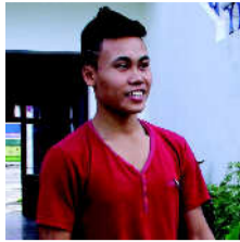
Port Blair, Sept 25