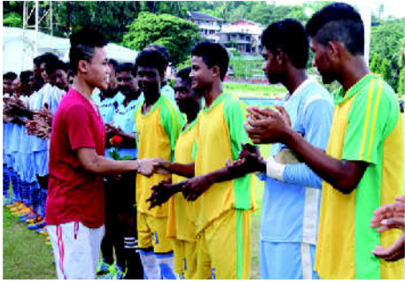
Port Blair, Sept. 25