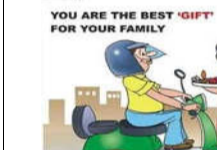
हेलमेट पहन कर वाहन चलायें ✓