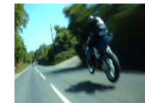
तेज गति से वाहन न चलायें ❌