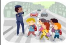
ट्रैफिक नियमों का पालन करें ✓

त्योहारों को खुशियों से मनाए और नियमों का पालन करें, || अगर आप चाहते हैं अपने परिवार का लंबे समय तक साथ, तो निभाए नियमों को और चले हमारे साथ सौजन्य: परिवहन विभाग