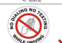
NO DIALING NO TEXTING WHILE DRIVING ❌