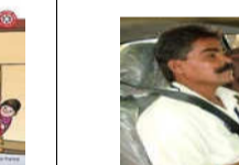
सीट बेल्ट बांध कर गाड़ी चलायें ✓