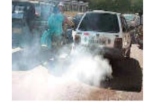
वाहन प्रदूषण ❌