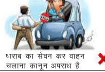
धराब का सेवन कर वाहन चलाना कानून अपराध है ❌

त्योहारों को खुशियों से मनाए और नियमों का पालन करें, || अगर आप चाहते हैं अपने परिवार का लंबे समय तक साथ, तो निभाए नियमों को और चले हमारे साथ सौजन्य: परिवहन विभाग