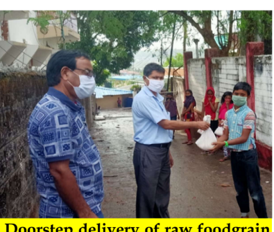
Doorstep delivery of raw foodgrain to students

the doorstep of the students alongwith the new textbooks for the academic year 2020-21. The Department through its Zonal Offices shall continue telecast of classes through Doordarshan, local cable television, radio and also circulation of digital content through home delivery of pendrives & CDs (Contd. on last page)