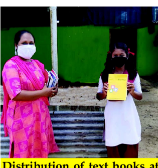
Distribution of text books at the doorstep of the students

Port Blair, May 19 The COVID-19 pandemic has redefined the paradigms of school education from classroom pedagogy towards developing self-reliance capabilities in our learners. In this scenario, the Department of Education, A & N Administration for the first time has released pre-school books for its pre-