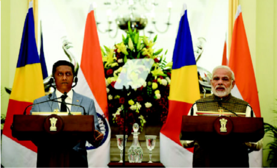
ceremonial reception at the Rashtrapati Bhawan Monday morning. He also met External Affairs

New Delhi, Jun 25 India and Seychelles signed six agreements on Monday in several fields including education, cyber security, and cultural exchange. The agreements were signed following delegation-level talks between Prime Minister Shri Narendra Modi and President of Seychelles, Mr Danny Antoine Rollen Faure in New Delhi. Both the leaders reviewed the wide-ranging cooperation between the two countries, especially in the fields of defence and security. The visiting dignitary was given a