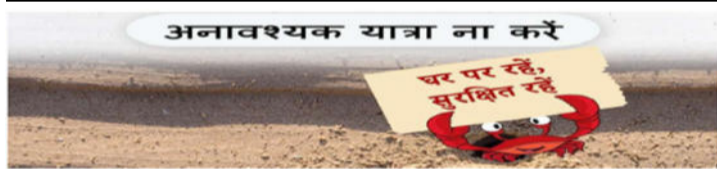
24x7 CONTROL ROOM NUMBERS: 240126/232102/1077/1070

(Source: Principal Secretary (Health), A&N Administration)