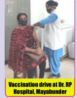
Vaccination drive at Dr. RP Hospital, Mayabunder

Port Blair, July 25 The safety of the citizens is the foremost priority of the Administration, especially during this pandemic time. To shield its citizens from the corona virus, the vaccination of eligible beneficiaries is being initiated by the Administration in different parts of the Islands. Accordingly, the vaccination began with administering of COVISHIELD vaccine for Health Care Workers followed by frontline workers and vulnerable population with co-morbidities. Subsequently, the vaccination for 45 and above was initiated