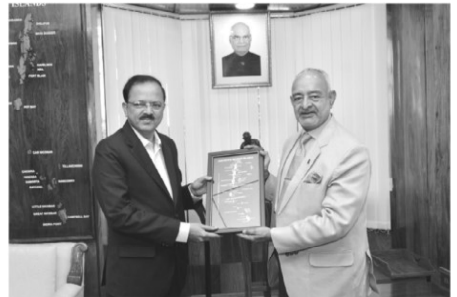
The Minister of State for Defence, Dr Subhash Bhamre, who is on a visit to the Islands, met the Lt Governor, Admiral D K Joshi, PVSM, AVSM, YSM, NM, VSM (Retd.) at Raj Niwas on 26th February 2018. Various security related issues were discussed on the occasion.

Under the Public Procurement Policy, every Central Government Ministry, Department and Central Public Sector Enterprises (CPSE) shall procure a minimum of 20% of their total annual value of goods or services from Micro and Small Enterprises (MSEs). Also 4% of total procurement of goods and services shall be made from MSEs owned by SC & ST entrepreneurs, a communication said.