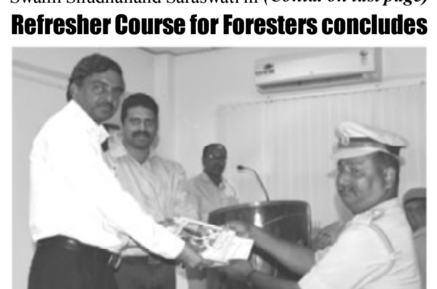
Port Blair, Feb. 26 The one week Refresher Course for the Foresters of the Department of Environment & Forests concluded yesterday with a simple function held at Forest Training Institute (FTI), Wimberlygunj. The course sponsored by the Directorate of Forest (Contd. on last page)