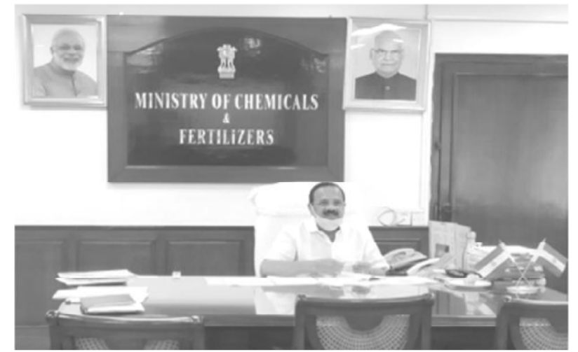
New Delhi, May 26