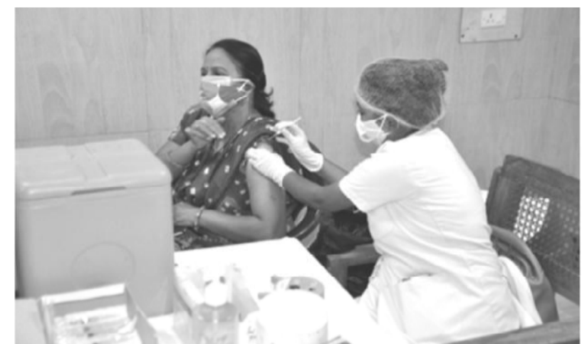
New Delhi, May 26

India has crossed 20 crore cumulative COVID-19 vaccination coverage on Wednesday. India achieved this milestone in 130 days since the start of the vaccination drive. The vaccination coverage crossed the 20 crore mark with 20 crore 6 lakh 62 thousand 456 doses including over 15 crore 71 lakh first dose and over four crore 35 lakh second dose of vaccines.