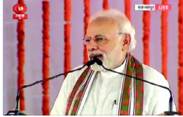
price of sugarcane to 275 rupees per quintal which is 80 per cent more than the cost of production. Prime Minister said his government has also imposed 100 per cent import duty on sugar and allowed export of 20 lakh tonne of sugar. This will

Shahjahanpur, July 21 Prime Minister Shri Narendra Modi has said that his government is according top priority to ensure that farmers get remunerative prices for their produce. Addressing a farmers' rally at Shahjahanpur in Uttar Pradesh this afternoon, Shri Modi said the centre has taken a number of decisions recently for the welfare of sugarcane farmers. He said the government has raised the