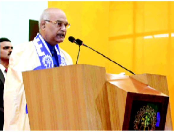
He said last year, of the 1 lakh 60,000 candidates who appeared for the IIT joint entrance examination, only 30,000 were girls. Of the nearly 10,900 students who had been admitted to undergraduate classes of the IITs in the same year, only 995 were girls. Shri Kovind said, this cannot go on, and there is a need to change this. Earlier, the President unveiled a plaque of a girls' hostel and a visitors' guest house named after former president Dr. APJ Abdul Kalam.

Kharagpur, July 21 President Shri Ram Nath Kovind has expressed concern over the low number of girls in premier institutions, like IITs. Delivering the 64th convocation address of IIT Kharagpur yesterday, Shri Kovind said, girls often outscore boys in board examinations, colleges and universities, but their number is distressingly low in IITs and this has to increase.