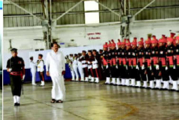
The Vice President, Shri M. Venkaiah Naidu inspecting the Guard of Honour, at Port Blair, Andaman & Nicobar Islands on July 05, 2018.