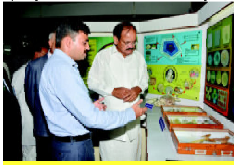
The Vice President, Shri M. Venkaiah Naidu visits Dweep Krishi Darpan at CIARI campus and evinced keen interest in the exhibits.

Expressing concern over the unstable income of farmers owing to risks