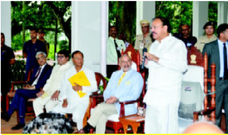
The Vice President, Shri M. Venkaiah Naidu addressing public meeting at Raj Niwas, Port Blair on July 5, 2018.