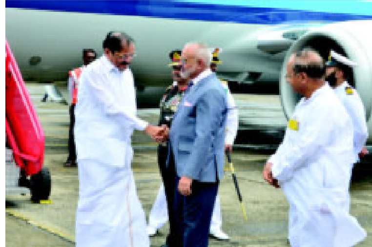
The Vice President, Shri M. Venkaiah Naidu being received by the Lt. Governor, A & N Islands, Admiral D.K. Joshi, PVSM, AVSM, YSM, NM, VSM (Retd.) on his arrival at Port Blair on July 05, 2018.