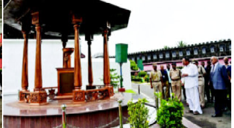
The Vice President, Shri M. Venkaiah Naidu visiting the Cellular Jail, in Port Blair on July 05, 2018. The Lt. Governor, Admiral D.K. Joshi, PVSM, AVSM, YSM, NM, VSM (Retd.) is also seen.