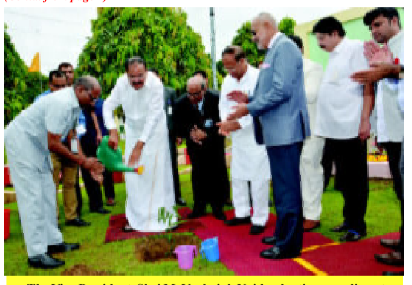
The Vice President, Shri M. Venkaiah Naidu planting a sapling at CIARI campus on July 5, 2018.

maximum benefit apart from providing MSP at 50 percent or more over the cost of production. Other income enhancing measures need to be taken to mitigate agrarian distress, especially of the small and marginal farmers, he added.