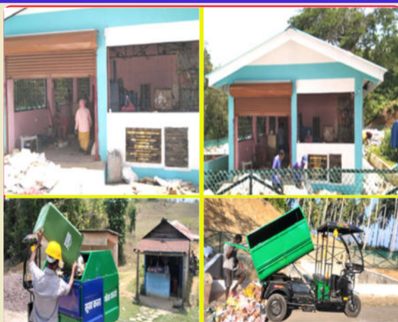
Waste Segregation Cluster and Door to Door Collection

Beodnabad is a village in Prothrapur Block of South Andaman of Andaman & Nicobar Islands, which was once infamous for open dumping and indoor-outdoor air pollution due to plastic burning at their surroundings, now they treat all the wastes scientifically by proper waste management and making ODF village.