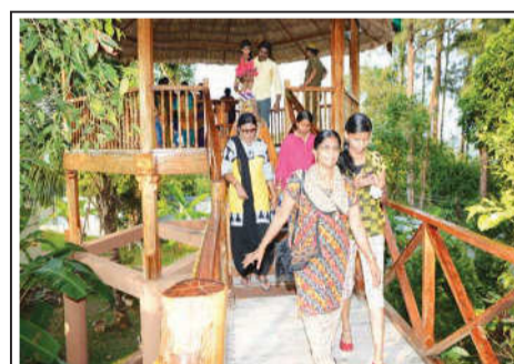
Large number of visitors visited Raj Niwas to see the gardens and other attractions on 25.02.2016. Raj Niwas will remain open for public till 28.02.2016 between 3.30 pm and 5.30 pm.

26 to 28. About 180 traditional dances during the festival. The objective of 'Adi Bimb' is to create awareness and spread the taste of the rich heritage of tribal culture among the new generations.