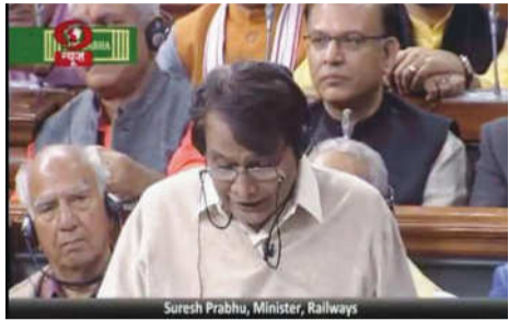
Suresh Prabhu, Minister, Railways

New Delhi, Feb 25 No hike in passenger and freight rates, over 65,000 additional berths, wi-fi services at 100 stations, improvement in passenger amenities including cleanliness, make rail a safer means of travel specially for women are some of the highlights of this year's Railway Budget 2016-17.