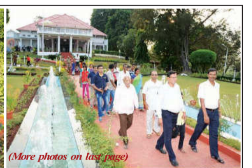
(More photos on last page)