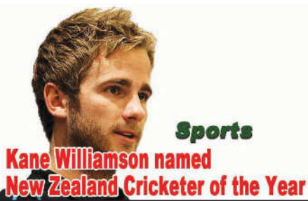
Kane Williamson named New Zealand Cricketer of the Year