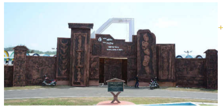
ITF Ground decked up for celebration of 'Adivasi Adi Bimb' - 2016.