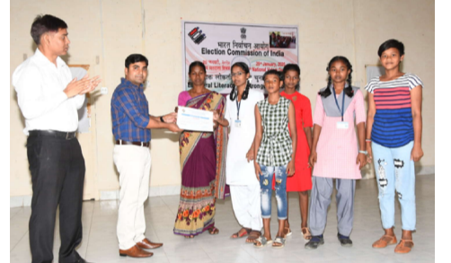
Port Blair, Jan 25