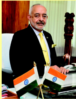
Sd/- (Admiral D K Joshi) PVSM, AVSM, YSM, NM, VSM (Retd.) Lt. Governor, A&N Islands and Vice-Chairman, Islands Development Agency

On this auspicious occasion, I wish that our Emerald Islands always progress on the path of peace, harmony and prosperity.