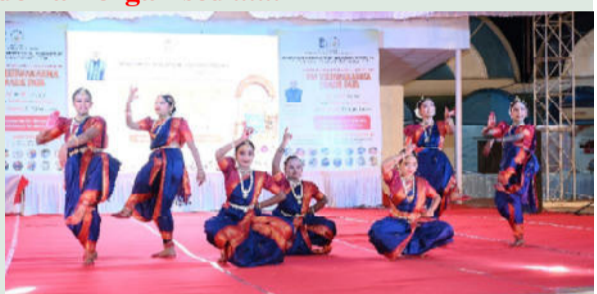
public interest and support for indigenous products and traditional skills.

A total of 70 stalls have been set up under the PM Vishwakarma initiative, showcasing a wide range of locally made products by artisans and micro-entrepreneurs. The event witnessed a large turnout of visitors, reflecting strong