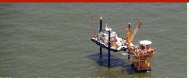
ONGC recently spudded the stratigraphic well AND-P-1 on January 27, 2026, in the deepwater Andaman offshore basin, around 267 nautical miles from the Andaman and Nicobar Islands.

State-owned Oil and Natural Gas Corporation (ONGC) is accelerating efforts across frontier exploration, offshore redevelopment and global technical partnerships as it seeks to arrest production decline from ageing fields while strengthening India's long-term energy security. In a significant milestone for domestic exploration, ONGC has successfully spudded a critical stratigraphic well in the frontier Andaman offshore region, even as it scouts for global technical partners to revive production from its western offshore assets and deploys advanced digital technologies to optimise operations.