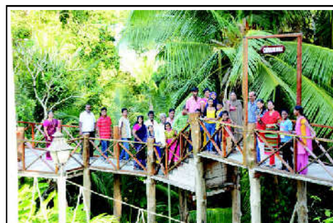
Raj Niwas, the official residence of Lt Governor of A&N Islands was opened for the public from February 25, 2016 from 3.30 pm to 5.30 pm. Thousands of people comprising children, women, elderly and families visited Raj Niwas to see the gardens and other attractions. 28.02.2016, being the last day for the public, people throngs in large numbers. Children particularly were seen absolutely delighted, running around the gardens and the lovely fountains and having wonderful time. (More photos on last page)