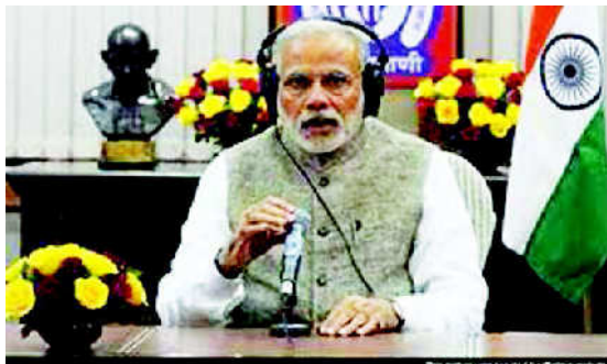
Bharat Ratna CNR Rao also spoke in this episode of the Mann Ki Baat programme.

attitude to sail through exams. Likening Chess with exams, Anand said brain recalls the right answer at the right time if the mind is calm. Laying importance on inner peace, Shri Modi recounted his own experience how deep breathing helps him cope with day to day pressures. The Prime minister laid emphasis on Yoga and how it is the key to develop the inner mind.