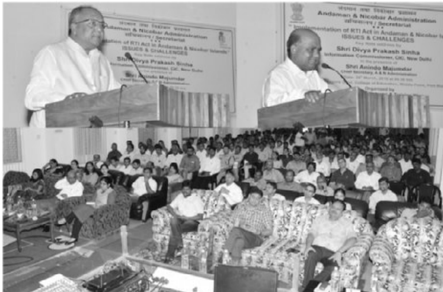
Administrative Reform & Training (AR&T) Wing of the Secretariat. Delivering his keynote