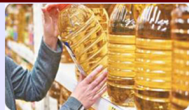
Buy Edible Oil in fixed and limited quantity

The Hon'ble Prime Minister has urged citizens to reduce edible oil consumption as part of the vision for a healthier and self-reliant India under Viksit Bharat 2047. Excessive consumption of edible oil and repeated reuse of cooking oil can lead to