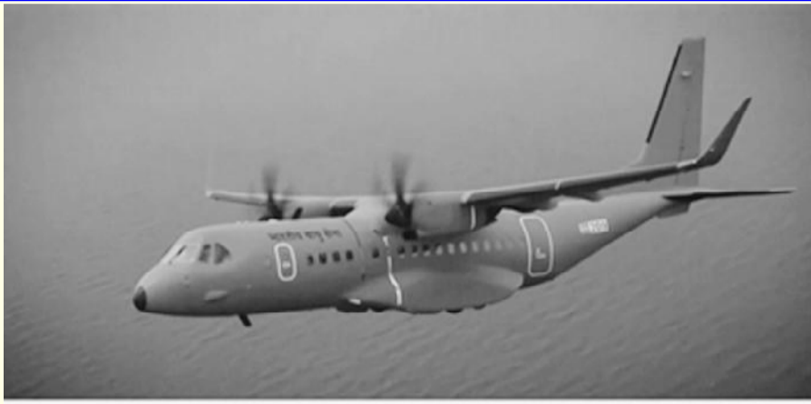
THE FIRST 'MADE IN INDIA' AIRBUS C-295 COMPLETED ITS MAIDEN TEST FLIGHT

Hon'ble Prime Minister exuded pride that India achieved success linked to the country's security and self-reliance this month. He attended a Navy-related event in Kolkata recently where INS Dunagiri, INS Sanshodhak, and INS Agray were inducted into the Indian Navy's fleet. Hon'ble Prime Minister was pleased to