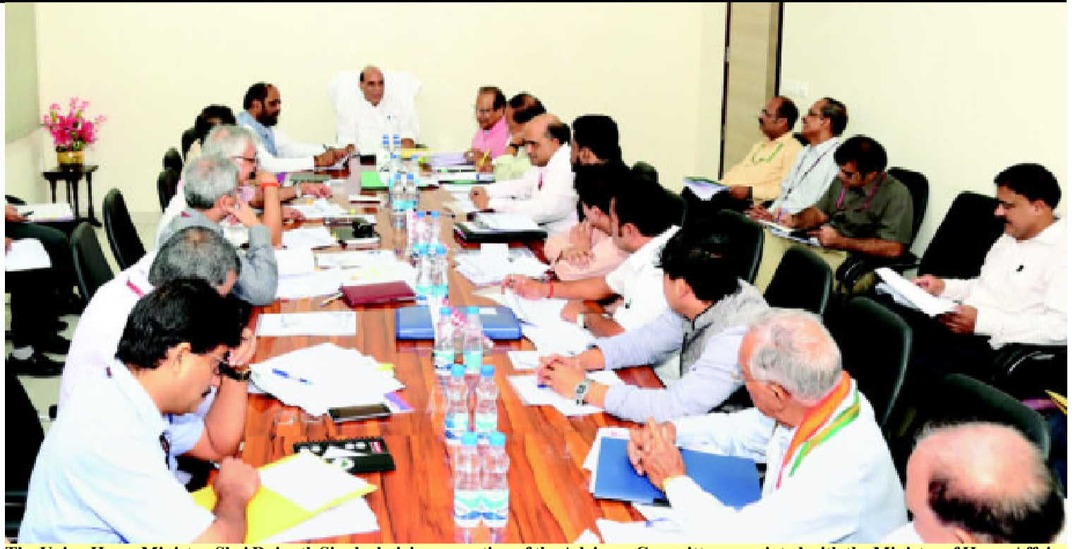
The Union Home Minister, Shri Rajnath Singh chairing a meeting of the Advisory Committee associated with the Minister of Home Affairs for the Union Territory of Andaman & Nicobar, in New Delhi on July 28, 2017. The Lt. Governor of Andaman and Nicobar Islands, Prof. Jagdish Mukhi, the Minister of State for Home Affairs, Shri Hansraj Gangaram Ahir and senior officers of the MHA and members of Andaman & Nicobar Advisory Committee are also seen.

The other items that were discussed during the meeting included revision of Minimum wages, filling up of Group 'B' & 'C' posts from the candidates belonging to A&N, establishment of AYUSH hospitals, implementation of Shekhar Singh Commission report and setting up of cold storage. Shri Rajnath Singh thanked the Members for the extremely fruitful and