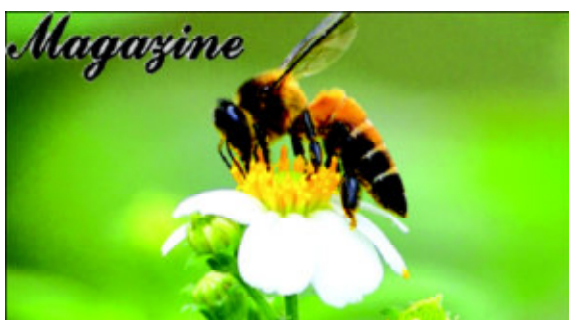
Flowers lure pollinating bees, says study