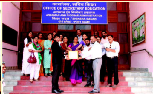
Learn From Home Initiative Team under State Institute of Education, Port Blair