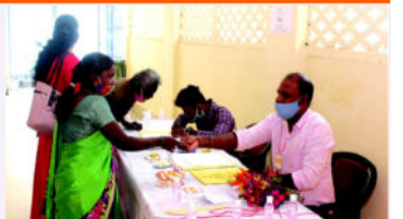
Loan availability (Contd. on last page)

The Port Blair Municipal Council in association with Ministry of Housing & Urban Affairs (MoHUA) and National Safai Karamchari Finance Development Corporation organised one day Loan Mela workshop today at Dr. B.R.Ambedkar Auditorium, Aberdeen Bazaar. The main theme of the workshop was to eliminate the manual scavenging of Septic Tanks & Sewers by adopting mechanised system. During the workshop, MoHUA & NSKFDC stressed & sensitized the Self Help Groups & Safai karamcharis towards the benefits for availing the scheme offering upto 50% direct cost subsidy and 100%