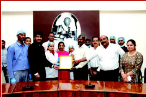
Regional Medical Research Centre, ICMR