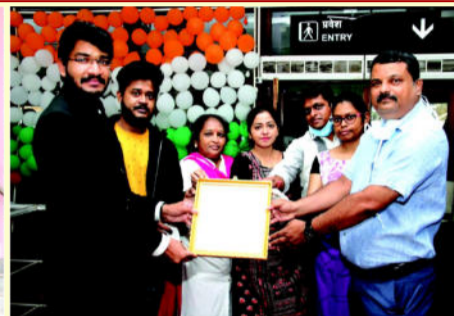
Airport COVID Surveillance Testing Team