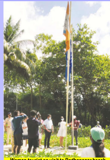
Woman tourist on visit to Radhanagar beach formally hoisting the Blue Flag

The Blue Flag Certification has been awarded to eight beaches spread across five States and two Union Territories and is accorded to beaches by an international jury comprising of United Nations Environment