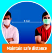
Maintain safe distance