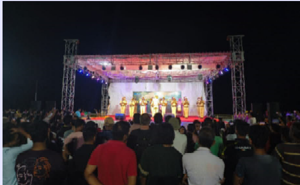
Cultural programme at Marina Esplanade as part of ITF-2025