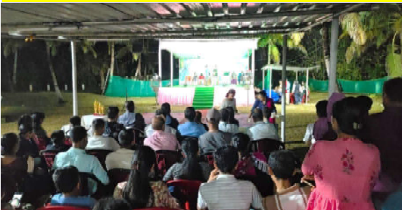
Cultural programme at Car Nicobar as part of ITF-2025