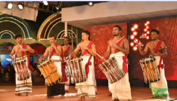
Cultural programme at ITF Ground

Sri Vijaya Puram, Dec. 28 substitute). This The Department of Sports and Youth Affairs will be conducting '3x3 Open B a s k e t b a l l Championship for Men & Women' on Dec. 30 at 4 pm at the Basketball Court, Netaji Stadium. Each team shall consist of not more than 4 players (3 players on the court and 1 winner and Rs. 3000/- Ph. No. 7063974074/ 9434270758 latest by 29.12.2025 at 5 pm. The matches fixture will be drawn on 30.12.2025 at 4 pm at Basketball Court, Netaji Stadium Complex and the inaugural match will be played at 5 pm onwards on 30.12.2025, a press r e l e a s e from Department of Sports and Youth Affairs over