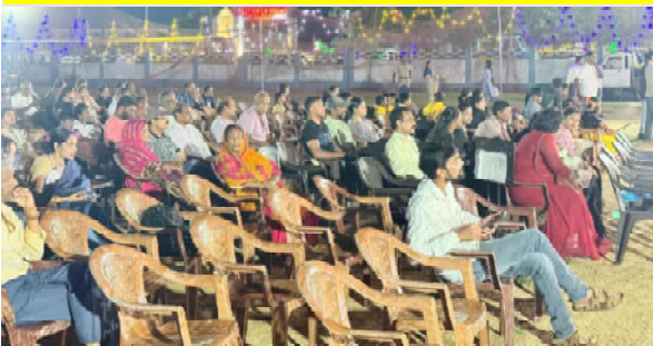
Cultural programme at Wimberlygunj as part of ITF-2025