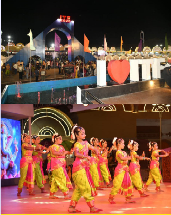
Cultural programme at ITF Ground

At the ITF Main Pavilion, the evening opened on an elegant note with performances by Aditya Natya Academy, followed by KRG Kalai Kaveri School. Artists of the South Zone Cultural Centre (SZCC)