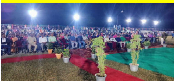
Cultural programme at Rangat as part of ITF-2025