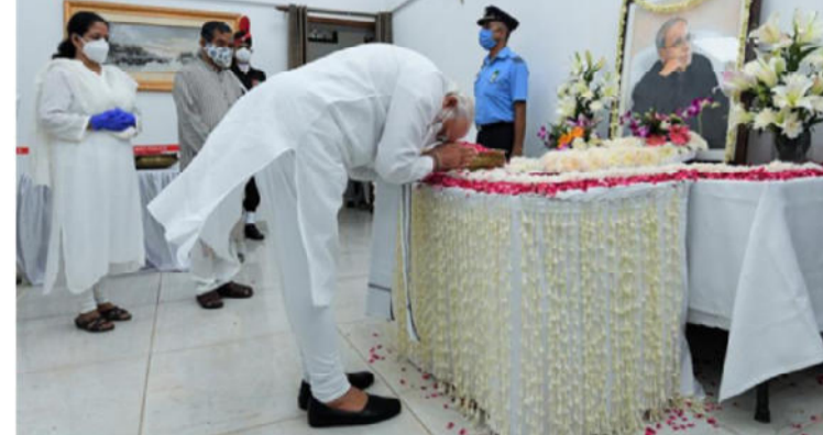
The Prime Minister, Shri Narendra Modi paying last respect to late Shri Pranab Mukherjee at his residence, in New Delhi on Sept. 1, 2020.

New Delhi, Sept. 1 Nation bid a tearful adieu to former President and Bharat Ratna, Shri Pranab Mukherjee. His last rites were performed with full military honour at the Lodhi Road crematorium in New Delhi this