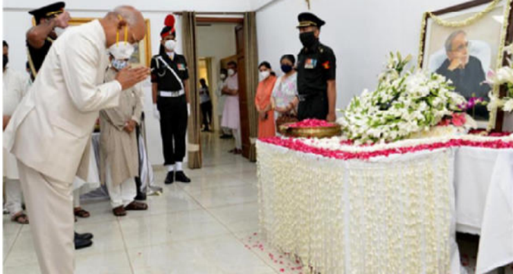
The President, Shri Ram Nath Kovind paying last respect to late Shri Pranab Mukherjee at his residence, in New Delhi on Sept. 1, 2020.