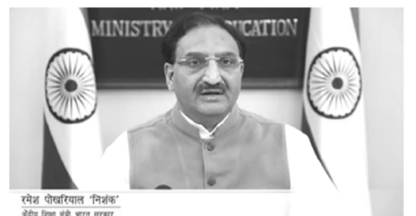
रमेश पोखरियाल 'निशंक'

The Union Education Minister Shri Ramesh Pokhriyal Nishank has approved the proposal to provide monetary assistance to Rs. 11.80 crore to students as a special welfare measure. This measure of the Union Government will benefit children studying in Class one to eight in the Government and Government aided schools across the country. The Education Ministry has