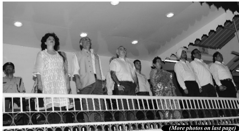
(More photos on last page)

The ceremony that set out with the bands of Army, Navy and A & N Police including Lady Police Pipe Band, marching in unison, playing popular marching tunes, followed by performance of