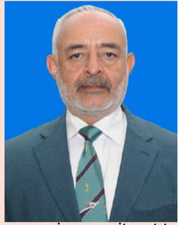
(Admiral D K Joshi)

On this special occasion, I wish happiness, prosperity and continued progress to the people of Rajasthan residing in these islands and to all those who carry the legacy of this great state in their hearts.