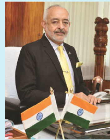
(Admiral D K Joshi) PVSM, AVSM, YSM, NM, VSM (Retd.) Lieutenant Governor Andaman & Nicobar Islands & Vice Chairman, Islands Development Agency

Once again, I extend my warm greetings and best wishes to the people of Goa. May the State continue to prosper and inspire the nation by harmoniously blending tradition with modernity, and sustainability with progress, while contributing significantly to India's growth and development.