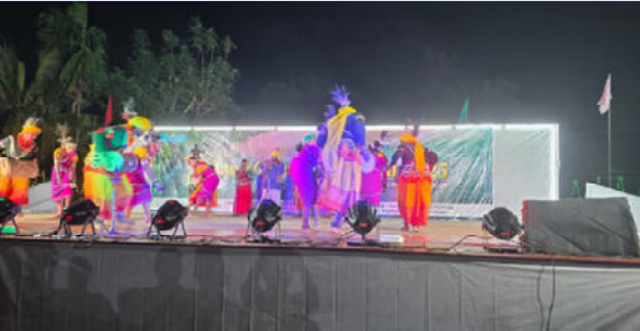
Cultural programme at Wandoor as part of ITF-2025