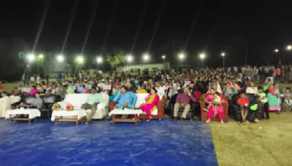
Cultural programme at Mayabunder as part of ITF-2025