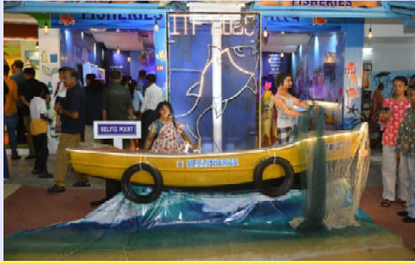
Glimpses of Island Tourism Festival-2025 at ITF Ground, VIP Road

A&N Command, Office of the Deputy Commissioner, North & Middle Andaman and Rural Development, PRIs & ULBs.