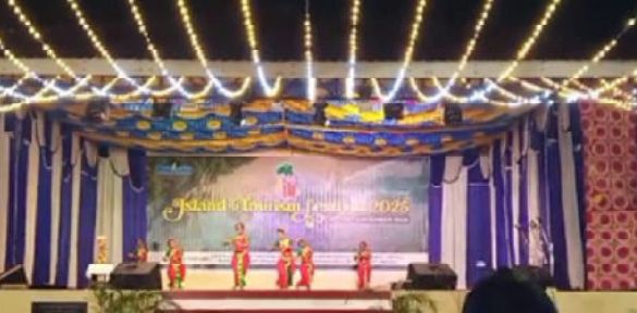
Cultural programme at Diglipur as part of ITF-2025