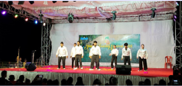
Cultural programme at Marina Esplanade as part of ITF-2025