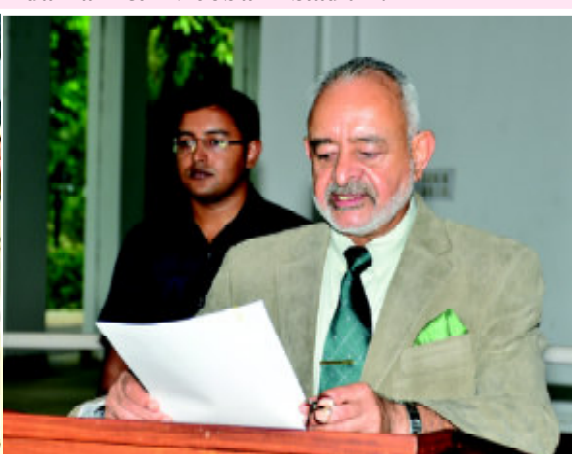
The Lt Governor, Admiral D K Joshi, PVSM, AVSM, YSM, NM, VSM (Retd.) administered "Pledge for Unity" to employees/staff of Raj Niwas, resolving to make our contributions towards ensuring internal security of our nation on the occasion of Rashtriya Ekta Diwas.