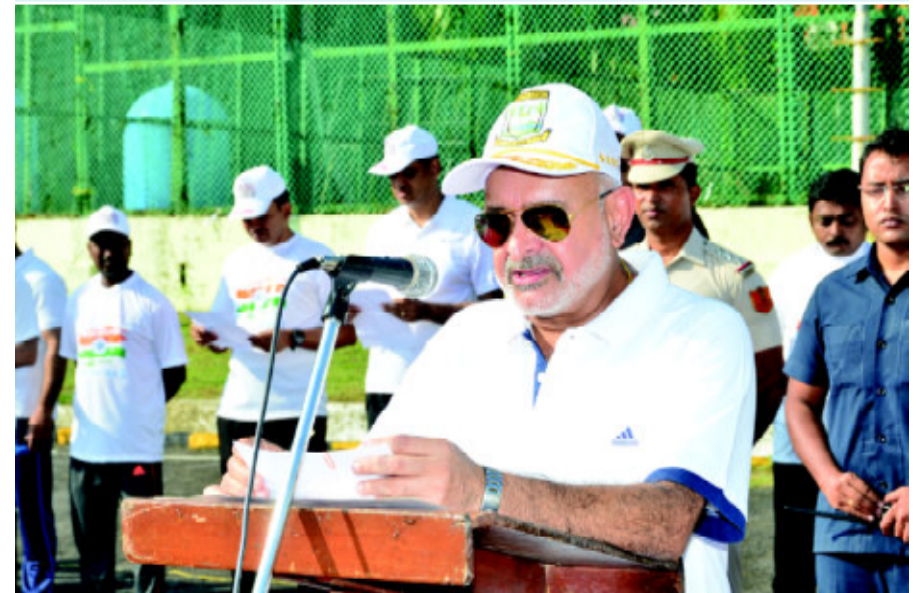
The Lt Governor, Admiral D K Joshi, PVSM, AVSM, YSM, NM, VSM (Retd.) administered 'Pledge for Unity' to elected representatives, students & citizens, and then flagged-off 'Run for Unity' on the occasion of Rashtriya Ekta Diwas (National Unity Day), reaffirming our zeal and devotion towards preserving the unity, integrity and security of our nation on 31st October 2018, at Netaji Stadium, Port Blair.

Police, IRBn, NSS & NYK volunteers participated in the 'Run for Unity'. The Run, which started from Netaji Stadium, passed through Clock Tower, Model School, Post Office, Bengali Club, Light House, Gandhi Chowk, Narayan Chowk and culminated back at Netaji Stadium.