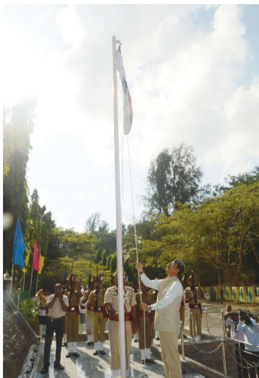
to include Dec.30 in the Islands Tourism Map as an event and organize a cultural extravaganza to celebrate this joyous occasion which will also help in boosting tourism in

The Lt Governor further stated that the aspect of declaring December 30 as 'Restricted Holiday' can also be looked into. Moving one step further, the Lt Governor asked the Secretary Tourism