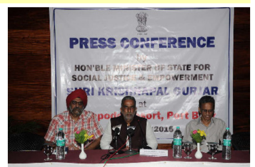
conference hall of the Megapode Resort here today.

Staff Reporter, Port Blair, Dec. 30 Accessible India Campaign (Suganya Bharat Abhiyan) launched by the Ministry of Social Justice & Empowerment, Government of India is a nationwide campaign for achieving universal accessibility for all citizens including Persons with Disabilities, to enable them to gain access and live independently, said the Union Minister of State for Social Justice & Empowerment, Government of India, Shri Krishna Pal Gurjar while speaking to the media persons at the