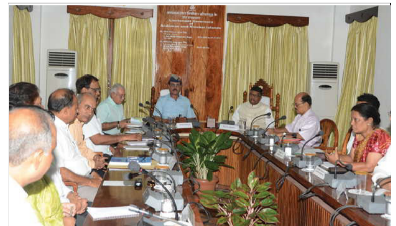
Hon'ble Lt Governor, Lt Gen A K Singh (Retd), briefing Shri Ravi Shankar Prasad, Hon'ble Union Minister for Communication & Information Technology, who is on a visit to these Islands at Raj Niwas on 30.12.2015.