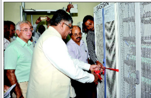
Union Minister of Communication & IT, Shri Ravi Shankar Prasad inaugurating the SGSN (Serving GPRS Support Node) on 30.12.2015.