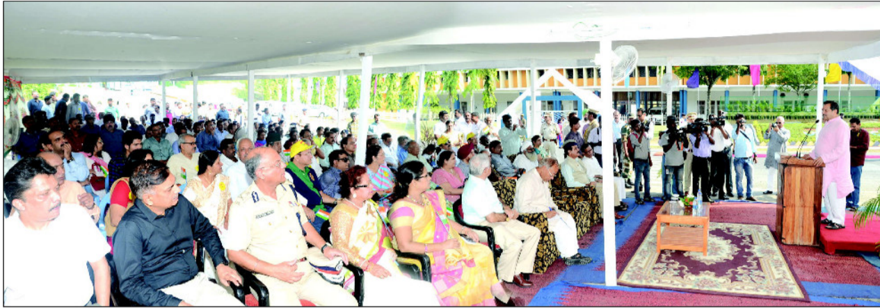
First hoisting of tri-colour by Netaji on Andaman Soil celebrated