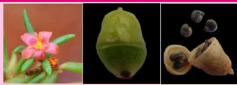
Portulaca laljii: Newly discovered Sun Rose Species.

Port Blair, Jan. 2 A new species, Portulaca laljii with potential horticultural significance discovered from the Eastern Ghats, India as new to Science. The Eastern Ghats are home garden for rich biodiversity of both flora and fauna, which are harboured tropical, deciduous and dry deciduous forests. This geographical region is astonished with number of hotspots, reserve forests and sacred groves containing number of (Contd. on last page)