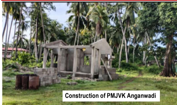
Construction of PMJVK Anganwadi