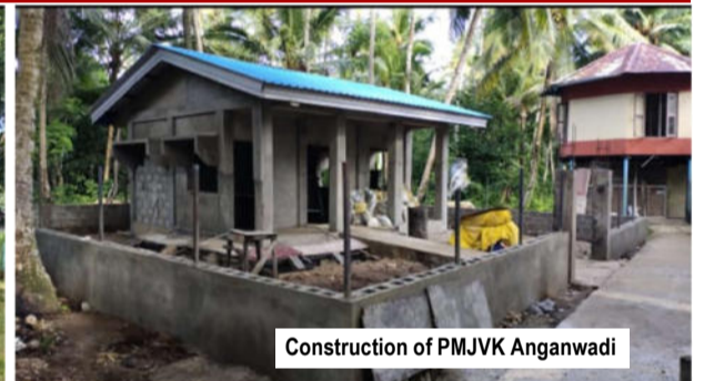
Construction of PMJVK Anganwadi

Port Blair, Aug 2 Ministry of Minority Affairs, Govt. of India launched the scheme namely Pradhan Mantri Jan Vikas Karyakaram (PMJVK) by restructuring the erstwhile Multi-Sector Development Programme for creation of infrastructure facilities in sectors of Health, Education, Skill Development, Employment and such other projects for improving the socio-economic